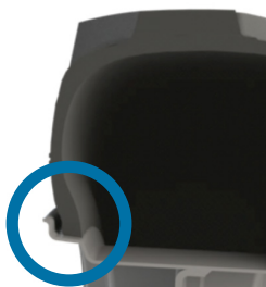
400/80-R4 TM R4